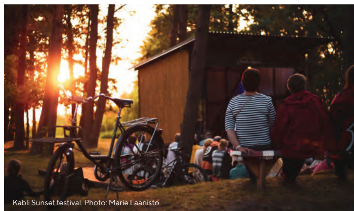
Kabli Sunset festival.

If you are looking for something different, check out small coastal villages like Kastna, Liu, Marksa or Saulepa.