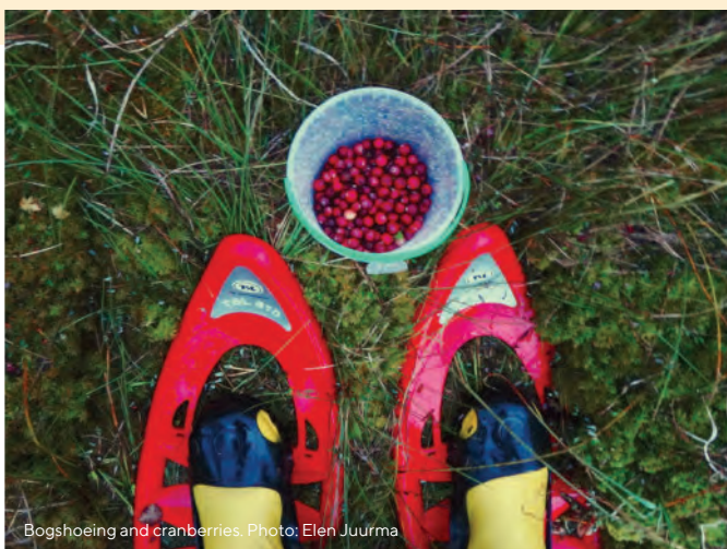
Bogshoeing and cranberries.

www.soomaa.com www.seikleabaks.ee www.kanuu.ee