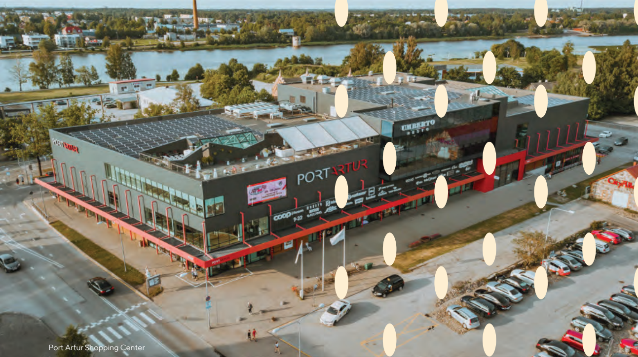
Port Artur Shopping Center