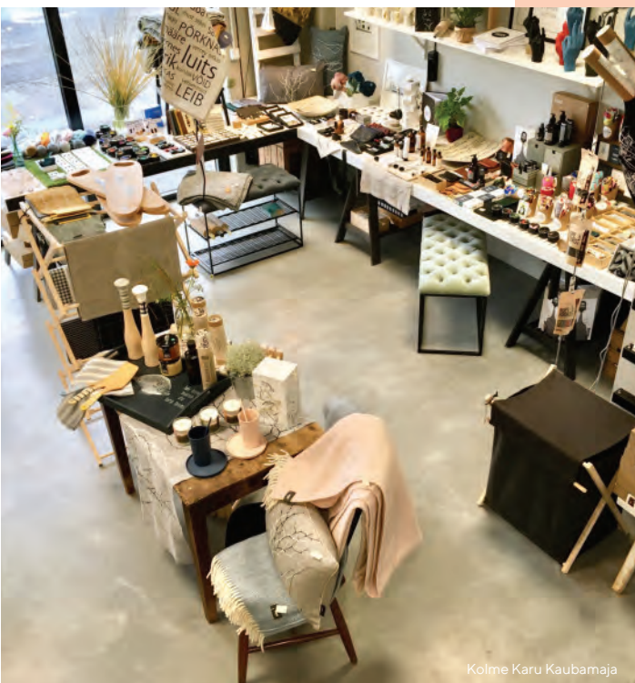
Kolme Karu Kaubamaja

The best places to find quality fashion, shoes, perfumes etc. are the shopping malls: