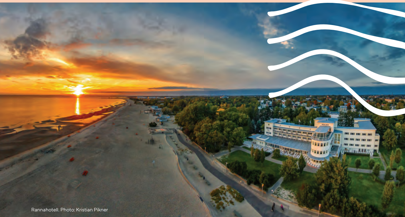
Rannahotell.

Pärnu is a resort town with long traditions, beloved first and foremost for its white-sand beaches and high-quality spa hotels, and internationally renowned as a holiday destination.