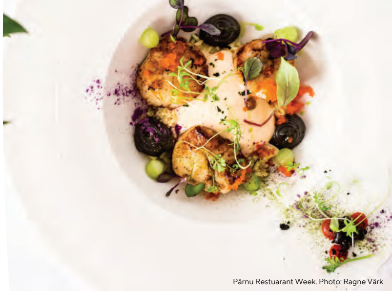
Pärnu Restuarant Week.