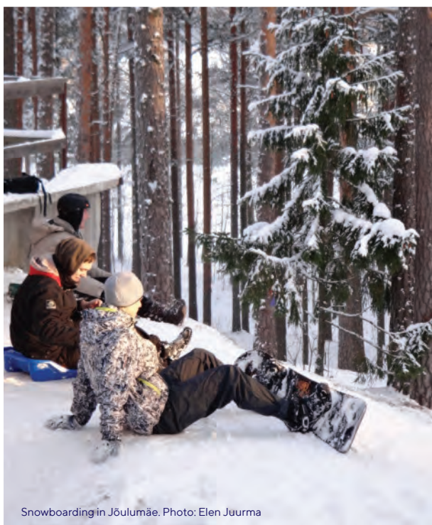
Snowboarding in Jõulumäe.