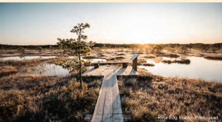
Riisa Bog.

Soomaa is well-known for having five seasons: spring, summer, autumn, winter and high water. Soomaa's numerous hiking trails can be visited at any time, but it is the flooding period that offers the most indelible impressions. During the flooding period, canoe and kayak enthusiasts can paddle beyond the river channels, right through the forest.