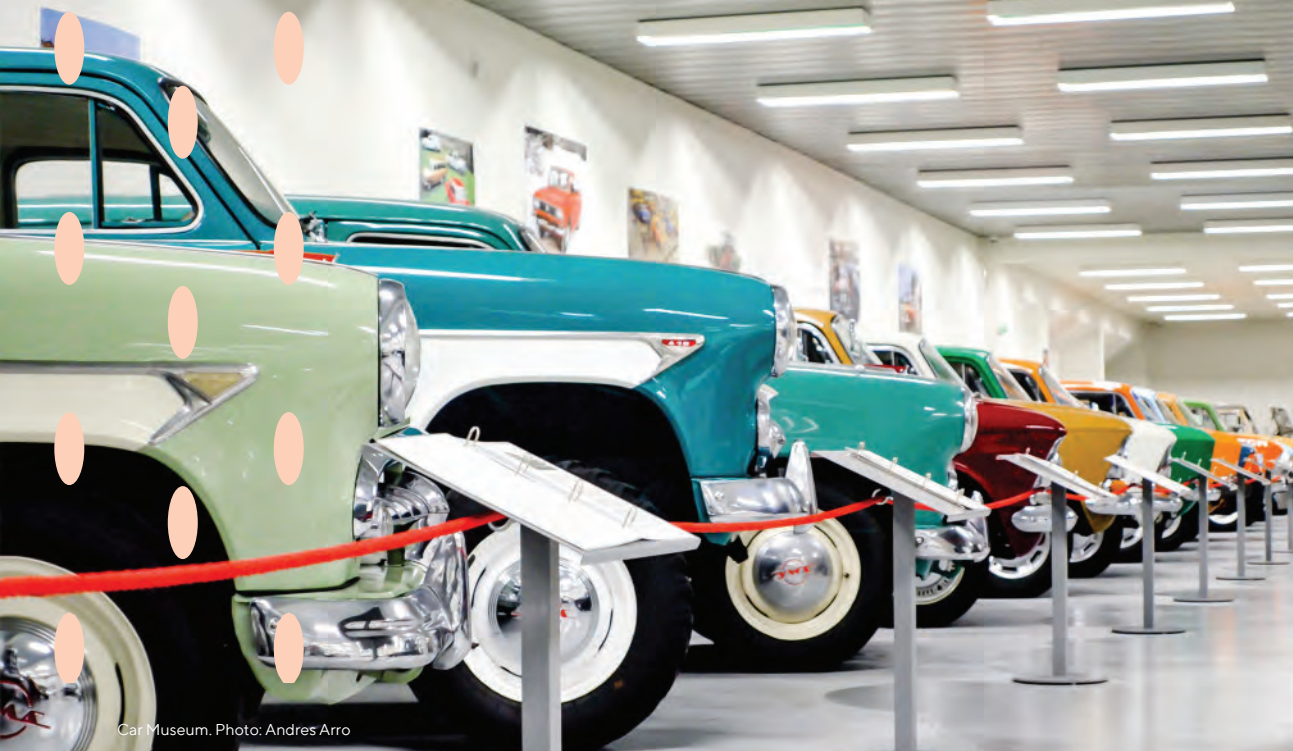
Car Museum.