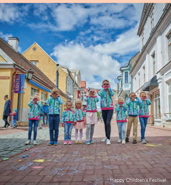
Happy Children's Festival