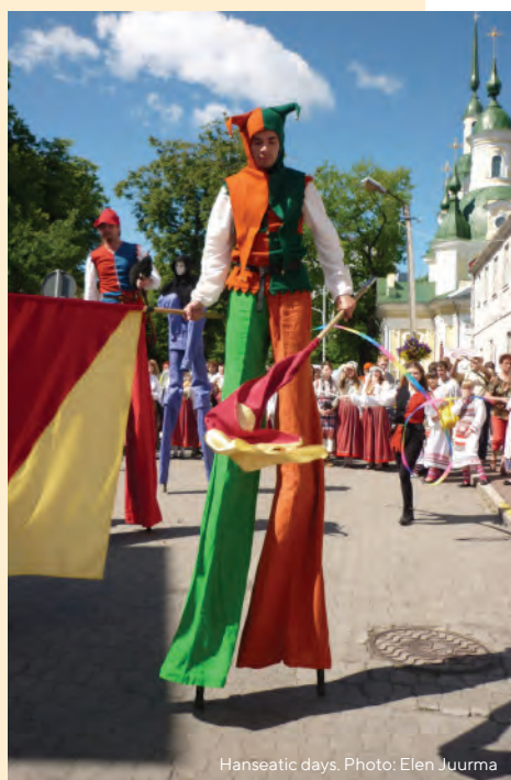
Hanseatic days.

The permanent exposition at the Pärnu Museum, 11,000