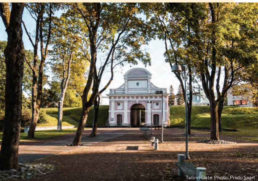
Tallinn Gate.

The Tallinn Gate is the only 17th century moat gate still extant in the Baltic states.