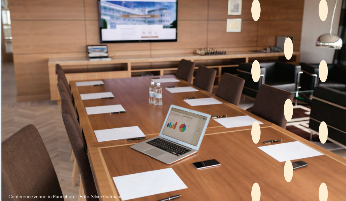
Conference venue in Rannahotell.