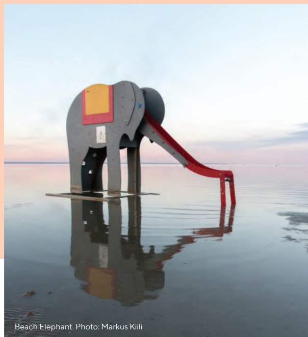
Beach Elephant.

For 100 years already, a section of the beach in Pärnu has been designated to be used solely by females. Estonia's only beach, assigned exclusively for women, provides a safe, clothing-optional bathing area.