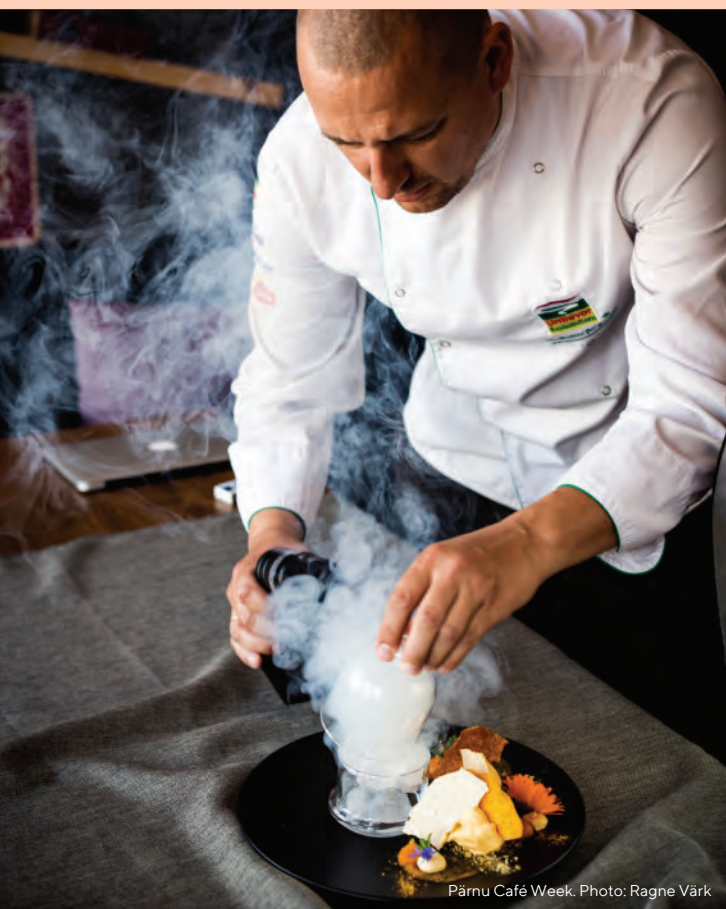
Pärnu Café Week.

Besides Pärnu's romantic cafés and acclaimed restaurants, local cider-houses and wineries are also flourishing.