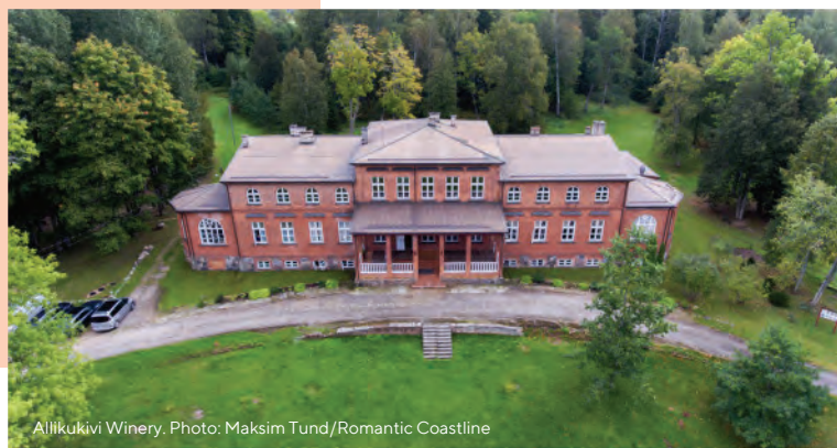
Allikukivi Winery.

www.siidritalu.ee www.jaanihanso.ee www.mammfrukt.ee www.allikukivi.ee facebook.com/pootsimois