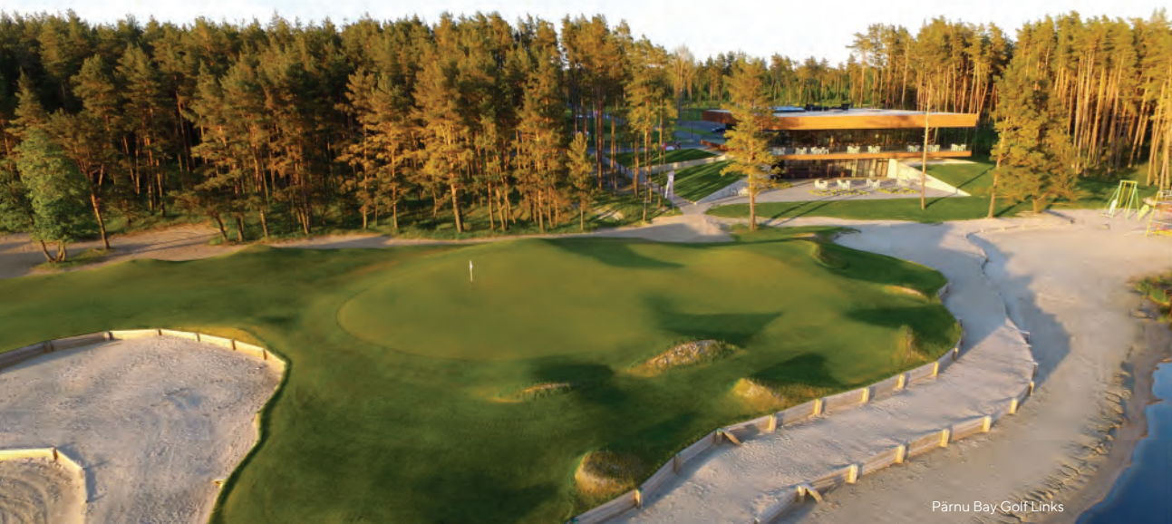
Pärnu Bay Golf Links