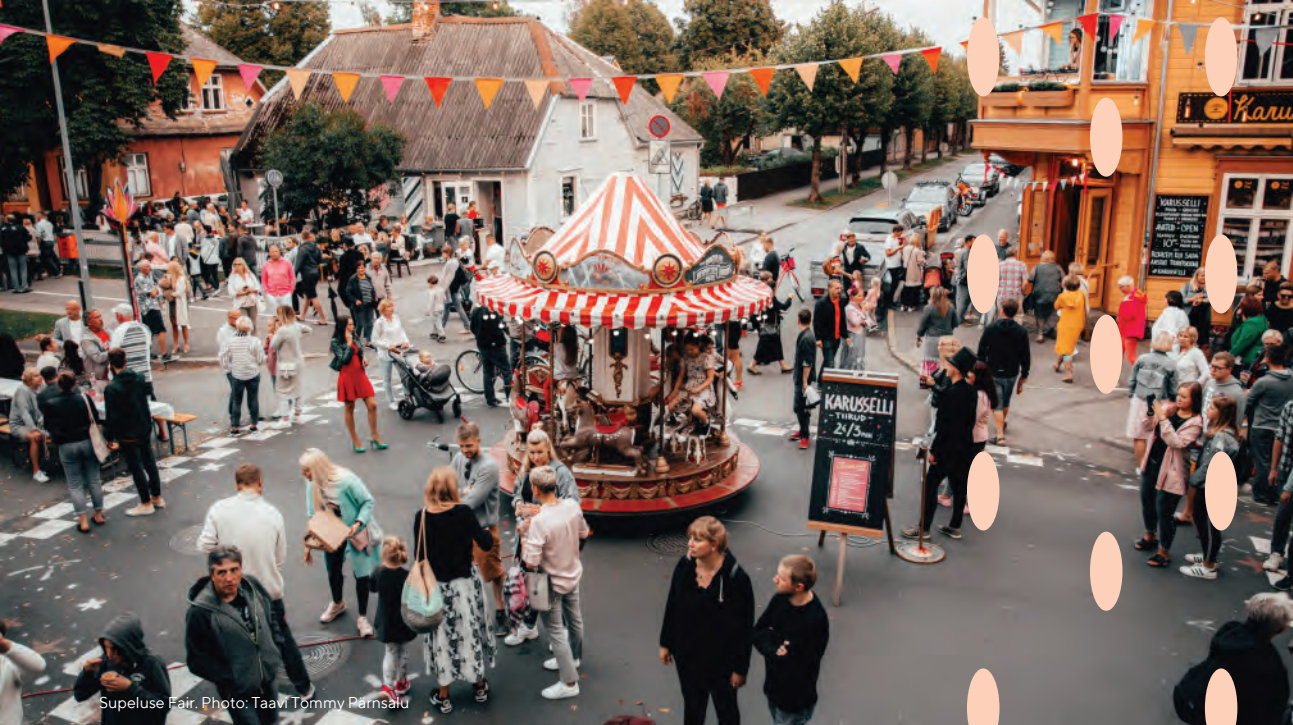
Supeluse Fair.