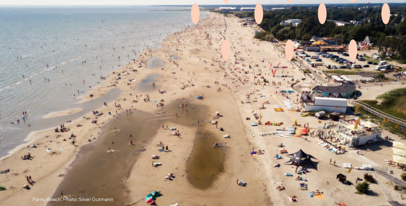
Pärnu Beach.