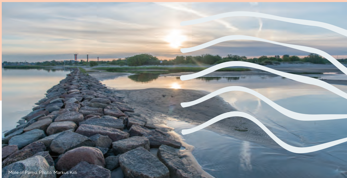
Mole of Pärnu.

Pärnu County has 250 km of coastline, and thus there should be no shortage of secluded spots by the sea for anyone. We call it the Romantic Coastline. www.rannatee.ee