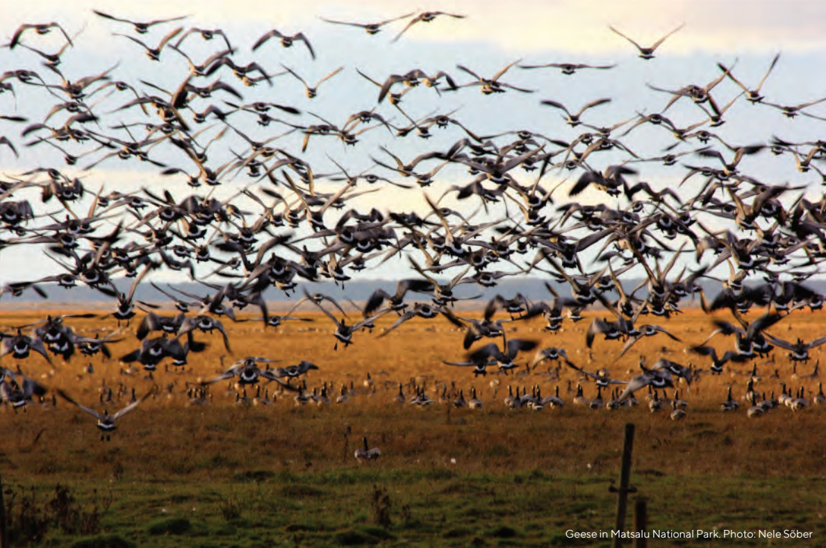
Geese in Matsalu National Park.