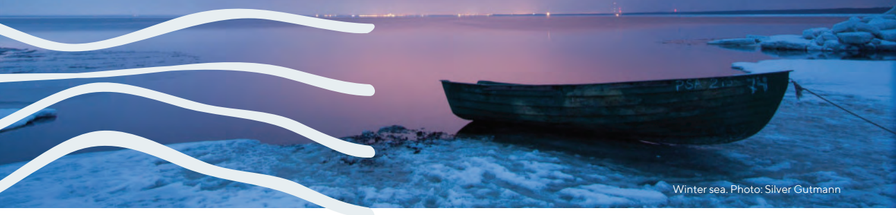
Winter sea.

Spas, museums, concerts and a city centre skating rink await you. The ice on the river is dotted with fishermen from early morning till late at night. The sea in winter is a sight unto itself