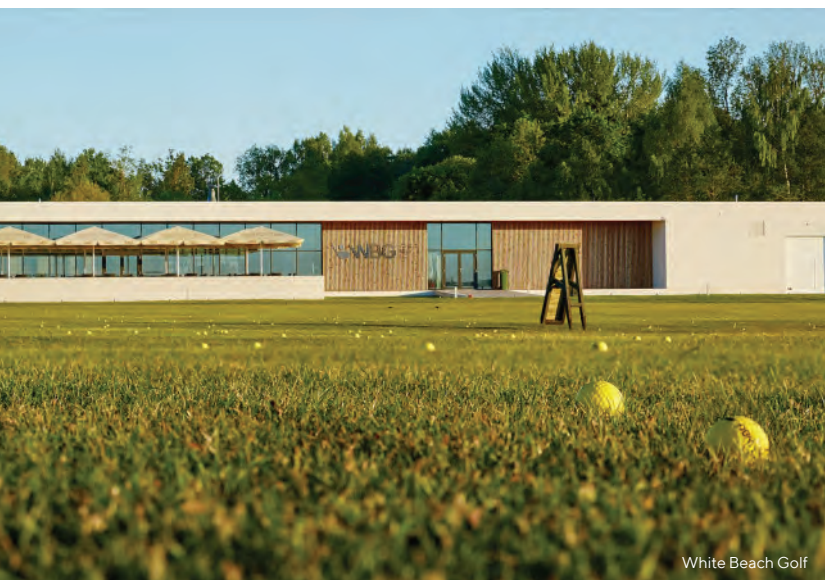
White Beach Golf