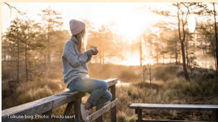
Tolkuse bog.

The diverse Rannametsa-Tolkuse interpretive trail leads past bogs and dunes, and offers picturesque views from an observation tower.