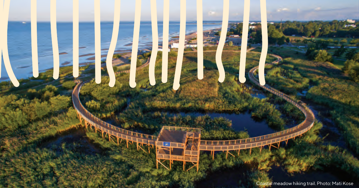
Coastal meadow hiking trail.