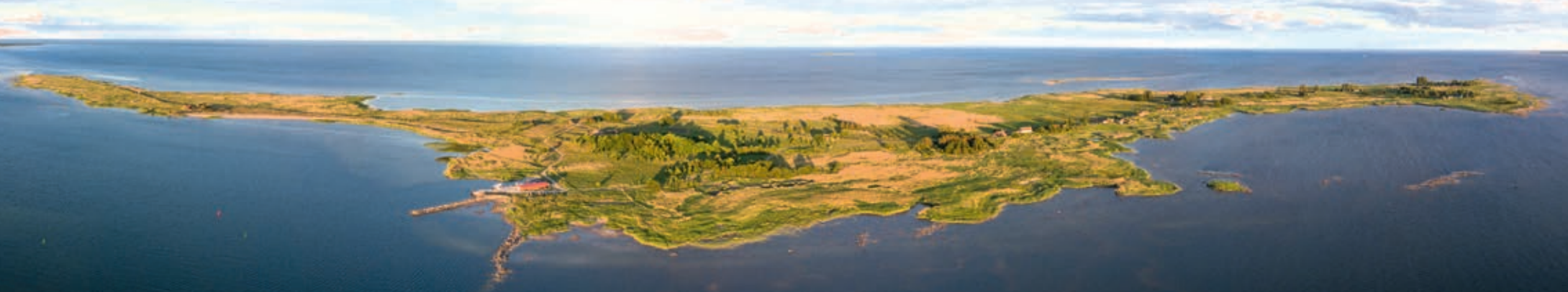
Manija landscape protection area