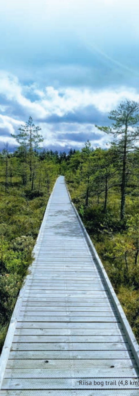
Riisa bog trail (4.8 km)